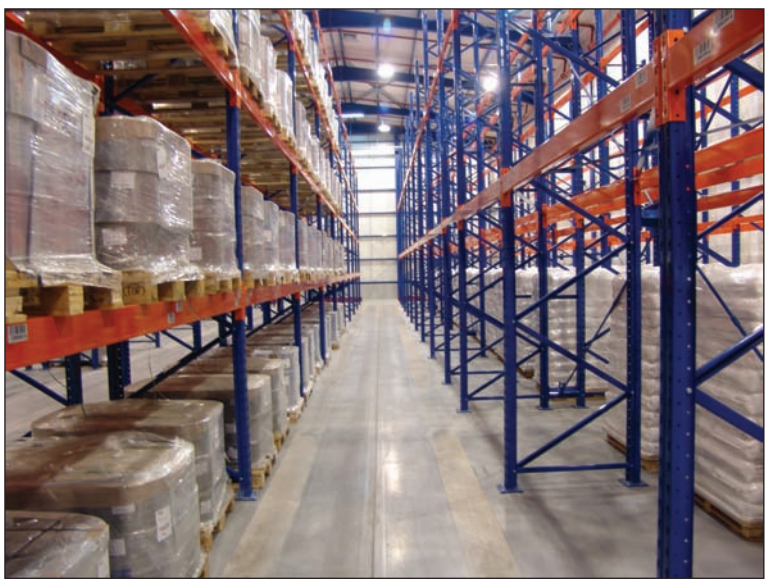
Just after the completion of the racking installation.

Overall, the work took 1 week from start to finish, was problem free and executed on time. This type of contract shows how Concrete Grinding Ltd can work alongside a flooring contractor such as Eurolit to offer a client a total solution. In addition, it demonstrates that the Laser Grinding process can be performed without any racking present - offering another level of flexibility to the main contractors project schedule.